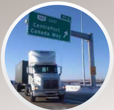
INTERNATIONAL TRUCKING HUB