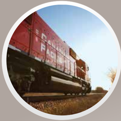
3 CLASS I RAIL CARRIERS (CP, CN & BNSF)

East to Europe, the Middle East and Asia